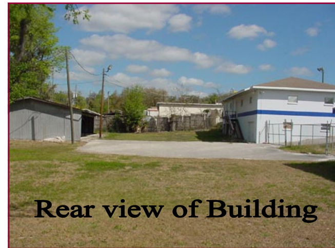
Rear view of Building

For Sale $350,000 MLS # 2130529 Main Office Building : 1,920 ± Sq Ft For Lease @ $1,750 + Sales Tax/Month