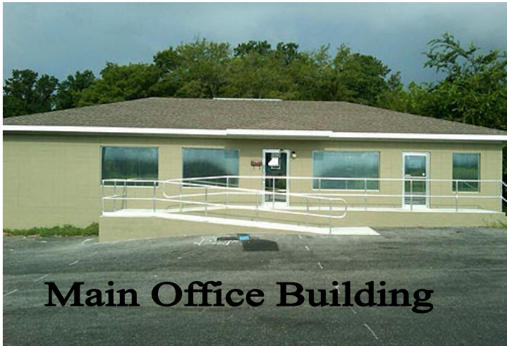
Main Office Building